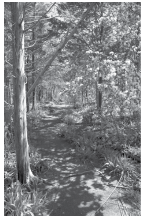
Above: WLCT Trout Brook Property.

The Westbrook Land Trust came into being in 1968 when there was concern over the development of ecologically invaluable salt marshes. With the donation of a privately held piece of land that year on Hammock Road, we began our journey preserving open space in concert with the Town. The Land Trust now owns 31 land parcels totaling over 150 acres, as well as the conservation rights to 51 acres. If you live near a parcel and would like to join in its stewardship, or simply appreciate the protected open space we preserve, please consider joining this organization. Write or email us at: WLCT, PO Box 1124, Westbrook, CT 06498. Email: WestbrookLCT@yahoo.com .