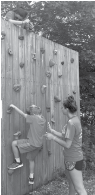
Supervision and safety measures at the Valley Shore YMCA summer camp allow children to explore active experiences including the Challenge Wall.

With Westbrook businesses opening, and many parents heading back to work, how do you protect your family's health and safety? Should you skip your annual physical? Your child's dentist visit?